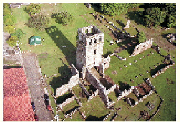
Old Panama's tower

Panama's climate is pleasingly tropical with usually the same temperature throughout the year, an average temperature of 27 degrees centigrade.