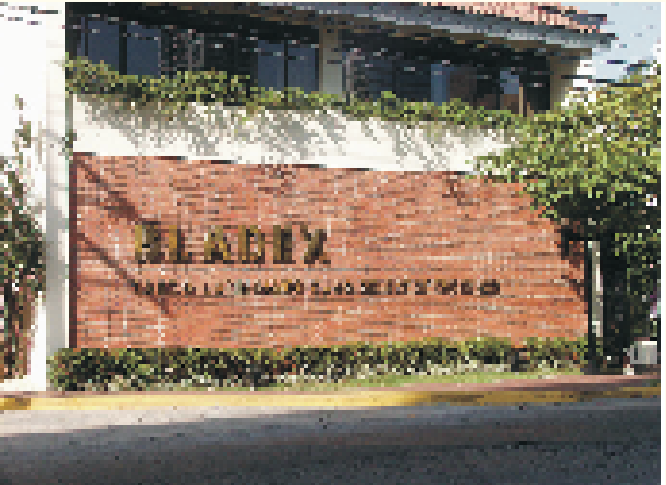
Latinamerican Exports Bank (BLADEX)

For 100 years, the US dollar has been the legal currency in Panama. With a strong economic stability, the financial system allows the free flow and transfer of capitals and its attractive fiscal system is an essential factor for the sector's development. There is a large variety of financial services at very attractive costs offered through banks, stock exchange, money exchange offices and financial companies. The interest rates in US dollars in the country are the lowest in the region. The growth of the financial center stimulated the develop-